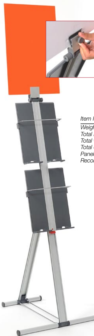
Item No. 10501 Weight: 1,5 kg / 3.3 lbs Total height: 1060 mm / 41.7" Total width: 480 mm / 18.9" Total depth: 450 mm / 17.7" Panel: Flexible size. Recommended A3/A4