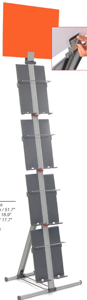
Item No. 10502 Weight: 1,9 kg / 4.2 lbs Total height: 1320 mm / 51.7" Total width: 480 mm / 18.9" Total depth: 450 mm / 17.7" Panel: Flexible size. Recommended A3/A4